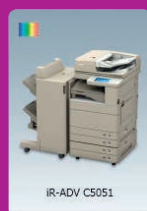
IR-ADV Quick Printing Tool

You have spent time creating your documents in Microsoft Office - now make them stand out with quick and easy finishing. With iW Desktop's Office Toolbar you can apply your own finishing templates directly from within Microsoft Word, PowerPoint or Excel. This means finished documents can be created in seconds, without having to navigate through printer driver settings.